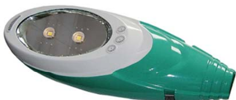
ST01 series 30-60W