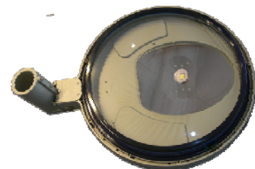
ST03 series 30W