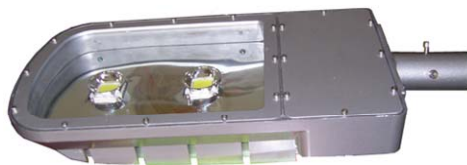
ST02 series 30-90W