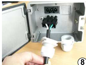
8 Plug the connector