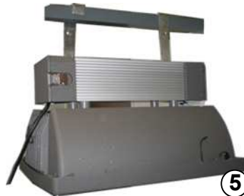
5 Hang the lamp