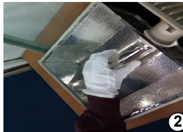
2 Put the HPS bulb with textile glove to avoid pollution on bulb