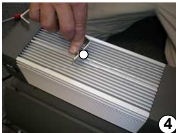
4 Put two hooks through the middle hole