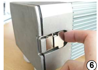
6 Open the connection box side Another side is fixed, not openable