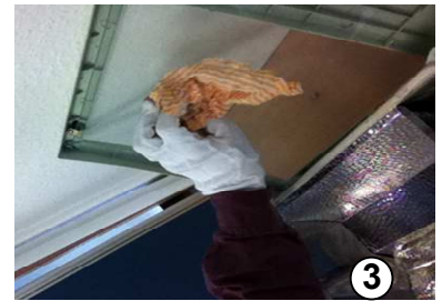
3 Clean the inside and outside of glass groundly