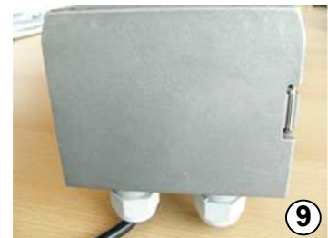
9 Screw to close the wire gap